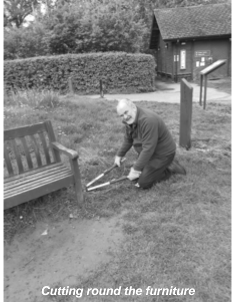
Cutting round the furniture

Going forward there are plans to repair the roof on the main bird hide and the platform on the little bridge over the dyke into Otter Holt Wood. After the floods, the Odell Village community came together and formed a work party to help clear and dig out a bramble covered outlet stream on our boundary. We will now be able to keep on top of any regrowth so we can monitor for any blockages in the stream that might cause excess water to back up during periods of heavy rain.